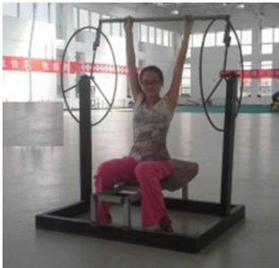
FIGURE 2 Photo of two hands rod handling circling shoulder flexibility training

The characteristics of the adopted technical scheme in this invention are that: the two ends of the turnstile with meter scale are respectively connected with a sliding sleeve, which are fixed on the radius sliding rods of the rotating disks, and the two sliding sleeves can freely slide on the two sliding rods. In the column of the fixed points of the supporting rods of the base fixed frame, here designs a kind of 20mm holes. The centers of the adjacent lifting holes on the supporting rod are away from 100mm. So, the vertical height between the first hole and the fifth hole can be increased to 400mm. According to the height of the practitioner, there are five different sockets can be taken. Untying the circlip behind the rotational bearing to arrange the two rotating discs in the suitable lifting holes and clamping with the circlip, the training can be started. These completely solve the schemes for the training of children and adults. The training device can adapt to more training crowds.